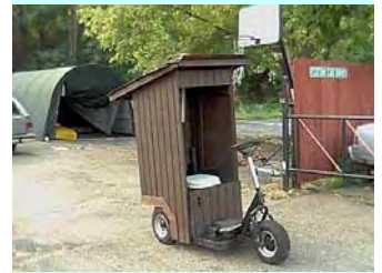
The Krip Kar Komode

Don't get caught out away from home - the new Krip Kar Komode is perfect for those embarrassing emergencies. Had a dodgy Ruby Murray, a fetid fish finger or just eaten at the mother-in-law's; then this is the perfect transport of convenience.