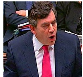
Gordon Bennett !!!

The popular TV Reality game show strikes out for another season of buffoonery and incompetence. Adored by those still able to afford a TV licence, this season's collection of unknown upstarts are shown above. Pick a winner from this lot and you are surely destined for Junior PM. Like a collection from the Muppets, similarities abound but Reality is just that. Nothing more than a dodgy bunch of no-hopers who are attempting to rekindle their flagging popularity. You can't beat the real thing !!! Gordo - get a life !!! Well batted in Crewe & Nantwich !!