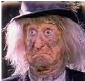
Wurzel Hi-So Gummidge