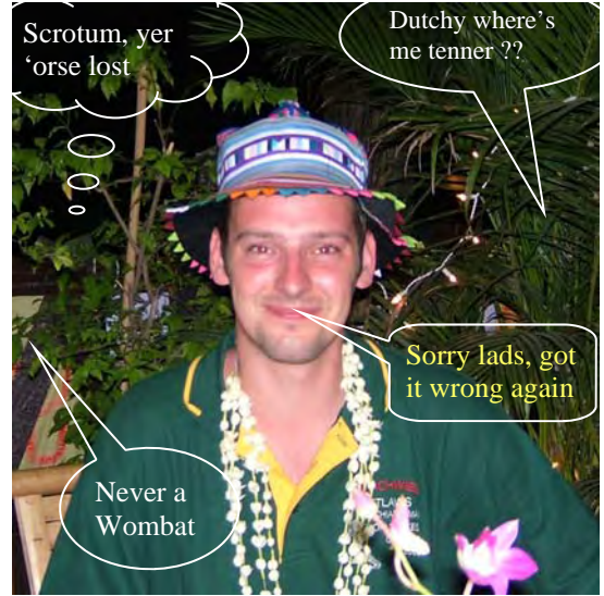
Yup, its the dead meat from Melbourne