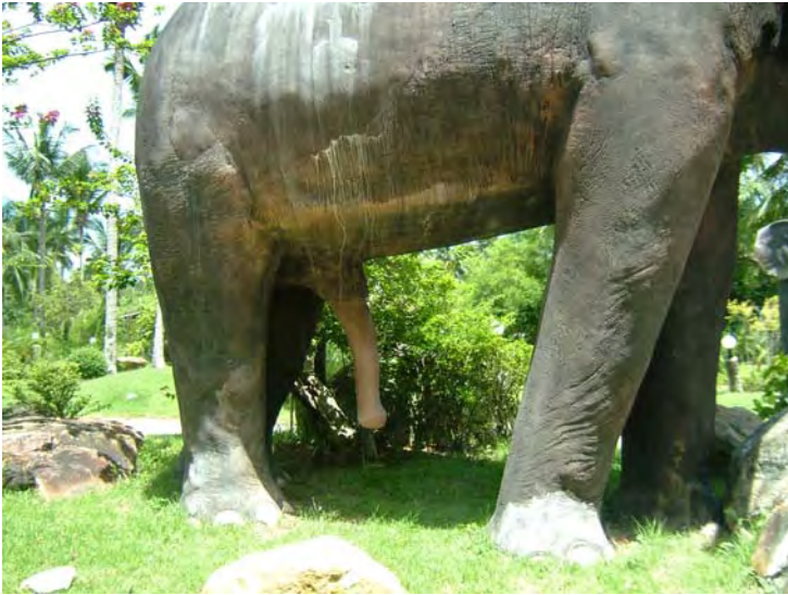
Not this one. It's a wooden elephant on Koh Chang