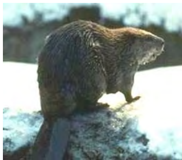
Rag Head Beaver