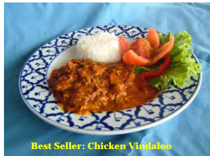
Best Seller: Chicken Vindaloo