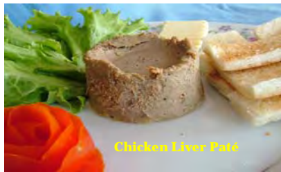
Chicken Liver Paté