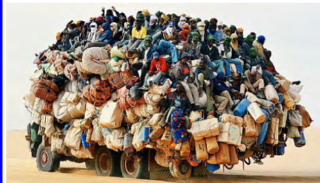
Room for one more, hop aboard !!