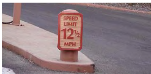
An English Traffic Sign

Sainsbury's, well deserving Prats of The Week!