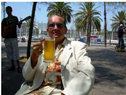
I'll Drink To That !!!